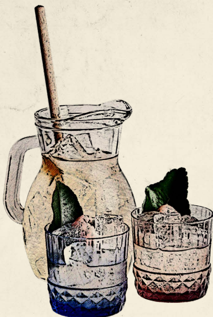
THANI STYLE 16 gls | 39 jug

Jasmin & makrut grape distillate, long chim lychee tonic, fizz